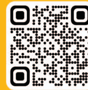
Scan for Site Location